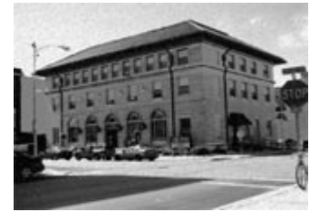
Livingston County Library as it stands today