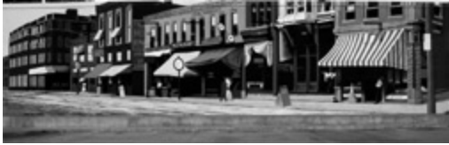
This street scene mural depicts downtown Chillicothe buildings. Some of which are still in use today on Webster Street.

Maintaining and repairing historic buildings are essential parts of downtown revitalization. Key maintenance issues must be addressed early to save building owners' time and money and to